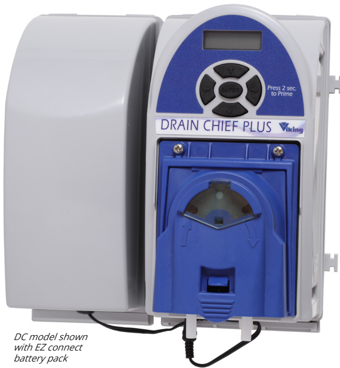
DC model shown with EZ connect battery pack