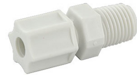
Plastic Compression fitting * Available with Drain Chief Plus only